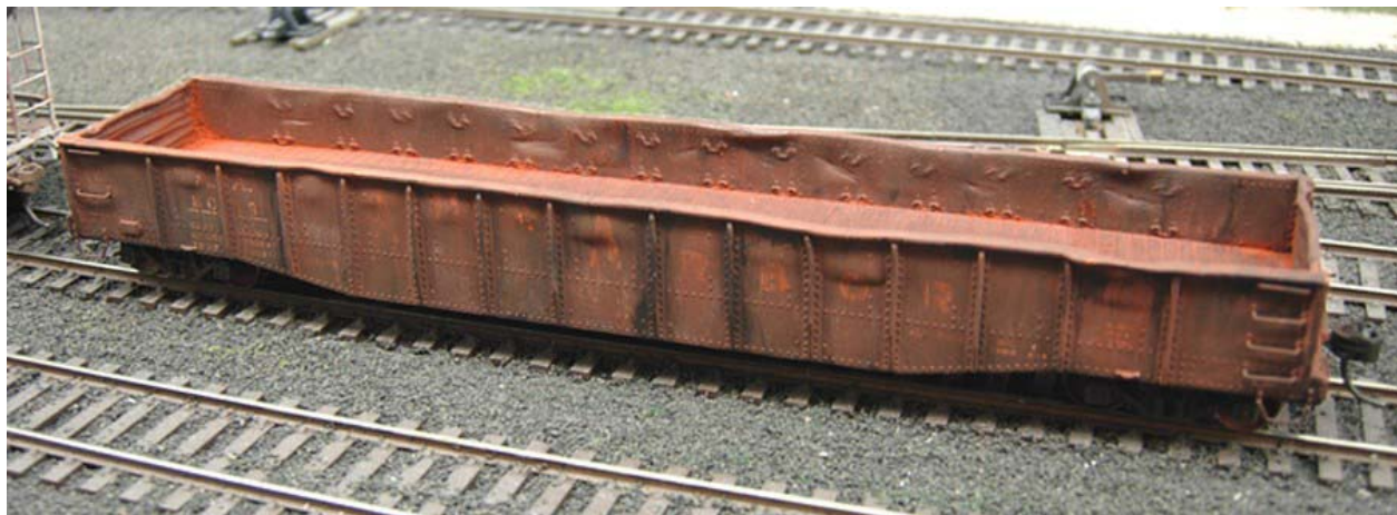
New and Old

My first step in demoralizing these cars was to add the dents. I borrowed a trick, from my teenage days when I spent time building WWII armored models, of using a candle to soften up the plastic. Using a candle allows you great control. Heat can be applied to a relatively small area, and controlled by the distance from the flame. I start by securing my candle to a small ceramic dinner plate. Light the candle and drip several drops of wax onto the plate, then before it sets, push the base of the candle into the wax. It'll hold pretty darn well.